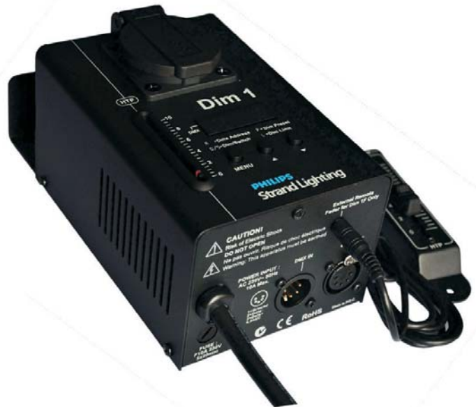
Dim 1 Single Channel Portable Dimmer