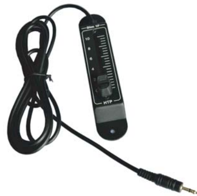
Dim 1 External Remote Single Fader